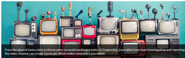
From the days of town criers to livestreams on social media as events are happening, journalists have been investigating and reporting the news. Anyone can create a podcast. What makes someone a journalist?

Transform teaching and learning and provide real-world work experiences through project-based learning (PBL) designed with cross-curricular applications. In our engaging PBL courses, students immerse themselves in individual and team projects like those in the world of work they'll inherit.